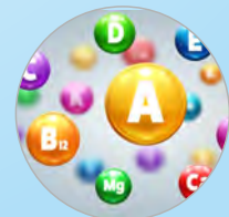
Vitamin & Nutrition